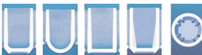
C Flat Bottom with curved edges U Rounded bottom 300 pul F Flat bottom C Starwell Flat bottom with curved edges and fins C8 Starwell View of the position of fins