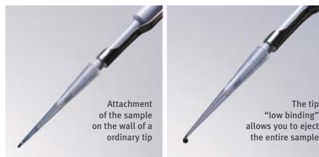
Attachment of the sample on the wall of a ordinary tip