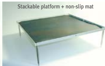
Stackable platform + non-slip mat