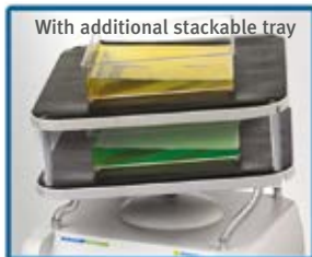
With additional stackable tray