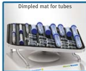
Dimpled mat for tubes