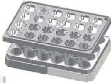
Plate for simultaneous handling of several inserts