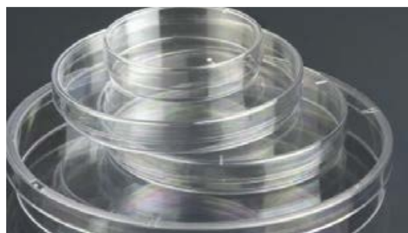
* General dimensions, see the data sheets on www.dulis.nl for more details. ** Double packaging