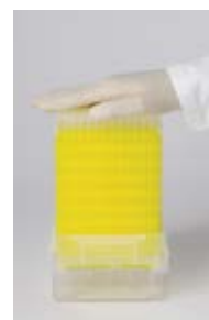
Place the tower on the refill box. Press firmly.