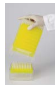
The tip tray is in place.