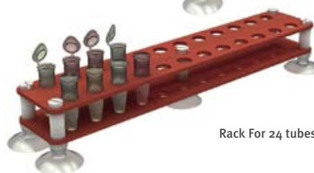
Rack For 24 tubes