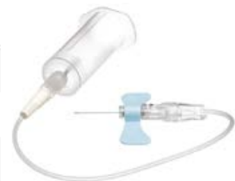
Push button + body