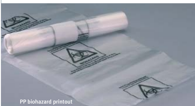
PP biohazard printout

Recommendation : to withstand the autoclave, the bags should not be sealed.