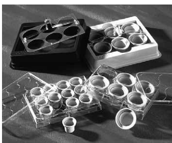
Polyester Netwell inserts