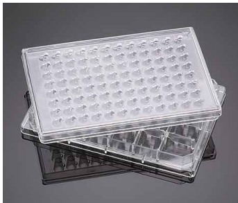
Falcon HTS insert plates