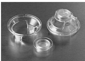
Polyester Snapwell inserts