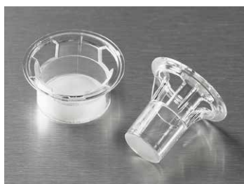
24 and 6.5 mm Transwell inserts