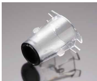
Corning FluoroBlok 6.5 mm insert