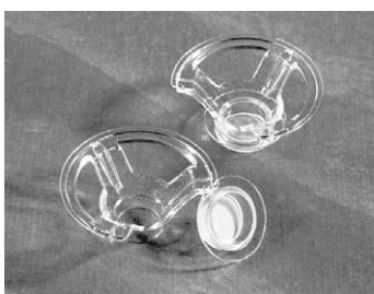
Polycarbonate Snapwell inserts